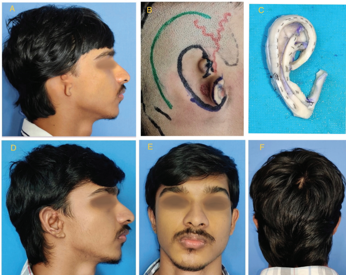
Fig. 2 A 19-year-old male with right lobule type microtia (A). Preoperative markings of subcutaneous pocket, lobule splitting incision, template, and superficial temporal artery (B) and a framework fabricated with 4-0 Nylon (C) result in the lateral, anterior, and posterior (D, E, and F) views 1.5 years post surgery.

When the opposite ear is prominent and hinders symmetry, contralateral otoplasty is a solution, but in our experience, patients generally do not opt for it.