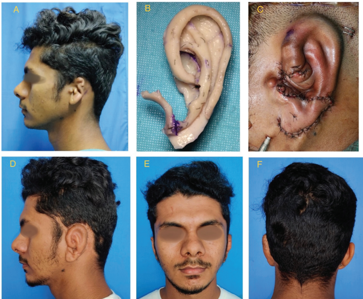
Fig. 7 An 18-year-old male with left lobule type microtia (A). Framework fabricated using both stainless steel wires and nylon sutures (B). Immediate postoperative result (C). Secondary corrections and second-stage elevation are depicted in –Figs. 4 and 5 . Result after 2.5 years after both stages of reconstruction (D, E, and F).