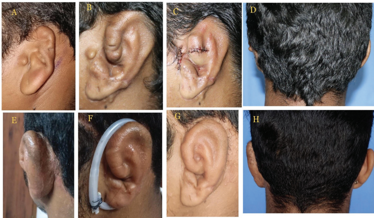
Fig. 5 An 18 year old male with left lobule type microtia (A). Result after stage 1 reconstruction (B). Secondary correction 3 months after the first stage (C). Note the inadequate projection after stage 1 (D). Result after second stage, that is, framework elevation (done 6 months after the first stage) (E). Silicone ring splint (F). Final appearance without splint (G). The final result 7.5 years post surgery, note improvement in projection (H).

Auricular reconstruction presents a surgical challenge because of the complexity of the normal ear structure.