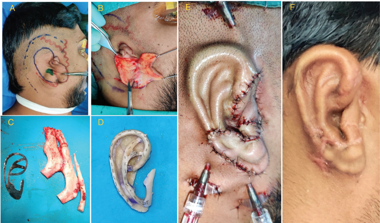
Fig. 1 First stage of microtia reconstruction: preoperative marking (A); split lobule with fine vessels preserved at base of flap (B); 6, 7, and 8 costal cartilages harvested (C); cartilage framework (D); immediate postoperative result—note suction drain system created using 16G cannulas (E); and final result 1.5 years later (F).

Position of auricle and skin incision for pocket creation are marked (► Fig. 1). Pocket creation and cartilage harvest are done simultaneously with two-team approach.