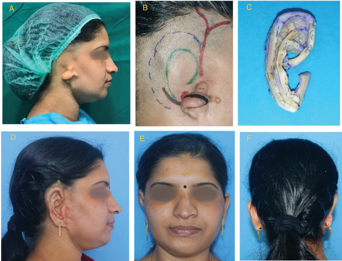
Fig. 3 A 28-year-old lady with right lobule type microtia (A). Preoperative markings of subcutaneous pocket, incision to transpose lobule, template, and superficial temporal artery (B) and a multi-piece framework fabricated with 4-0 Nylon (C) result in the lateral, anterior, and posterior (D, E, and F) views 1.5 years post surgery.

If the primary framework projection is not adequate, the second stage is performed after 6 months of the primary surgery.