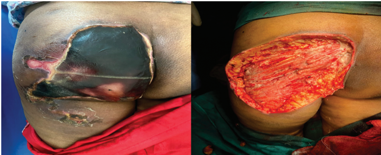
Fig. 1 A necrotic patch seen in the left gluteal region after intramuscular injection followed by debridement.

seen in the right gluteal region, extending to the posterior mid-thigh region.