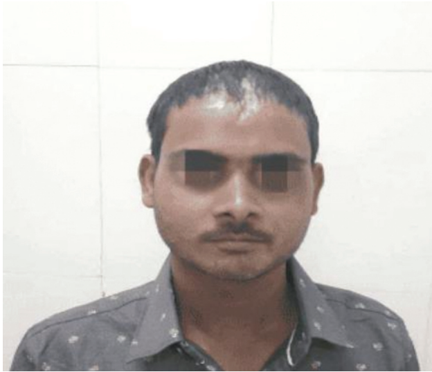
Fig. 6 Follow-up at 2 months.

Two months following the procedure, patient presented with adequate wound healing with an acceptable scar and noticeable hair growth (→ Fig. 6 ).