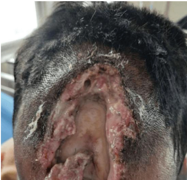
Fig. 1 Wound at presentation.