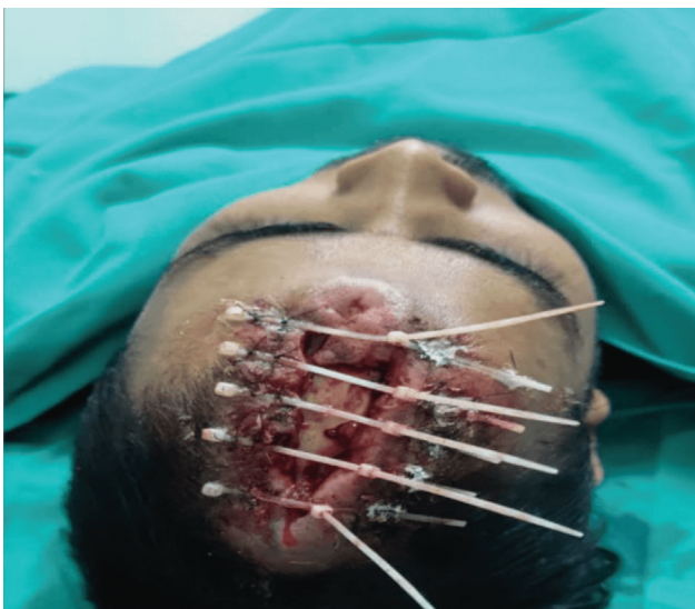
Fig. 3 Cable tie fixation to wound margins.

After wound debridement, multiple such units were fixed 2 cm from the wound margins at an interval of 2 cm from each other (► Fig. 3 ). The units were tightened daily till wound edge approximation was achieved in a week (► Figs. 4 and 5 ). The units were left in place for another week and were then removed after noting wound healing.