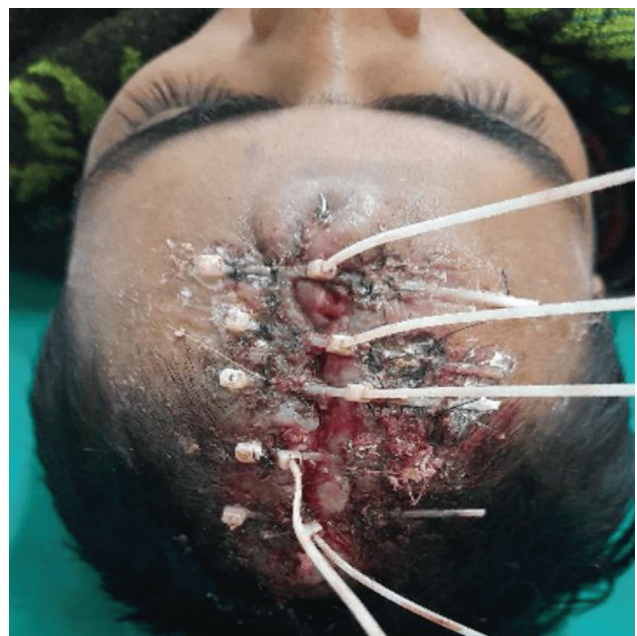
Fig. 5 Wound edge apposition.