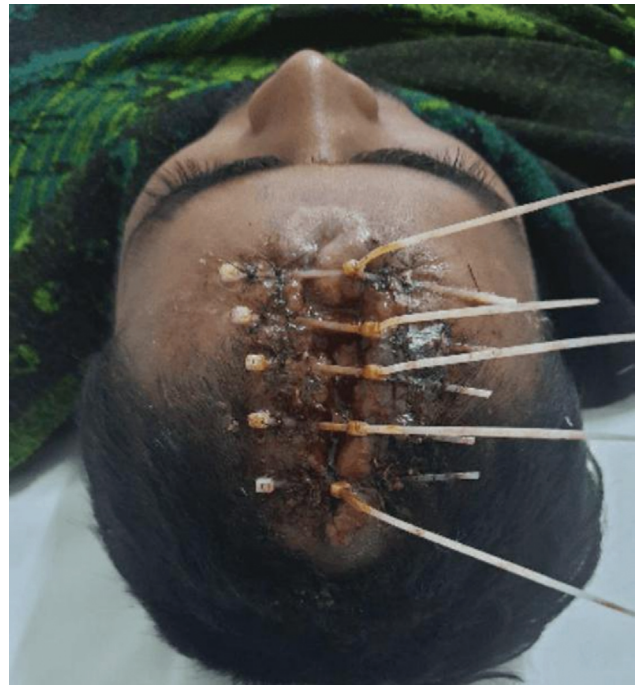
Fig. 4 Wound edge approximation.