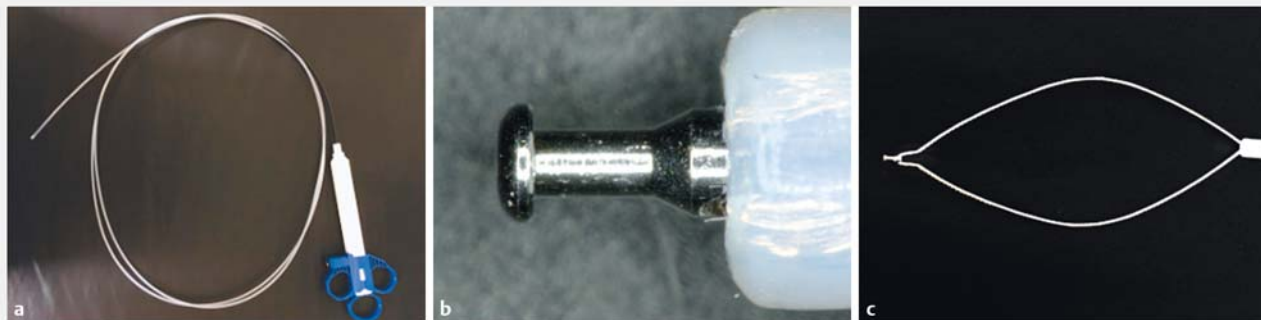
► Fig. 1 Details of SOUTEN snare. a A multifunctional snare, designed to achieve hybrid ESD. b A 1.5-mm needle-knife with a knob-shaped tip is attached to the top of the loop. c The length of the loop is 18.5 mm.