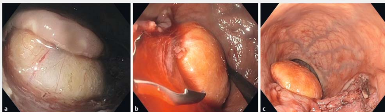
► Fig. 3 Endoscopic submucosal dissection (ESD) of the lipoma. a Endoscopic view of the lipoma. b Ligation of the vascular pedicle with a hemostatic clip; forward traction using forceps. c Endoscopic view of the lesion and the mucosal defect after ESD.