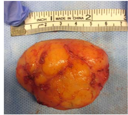
▶ Fig. 4 The resected specimen, 60 × 45 mm in size.