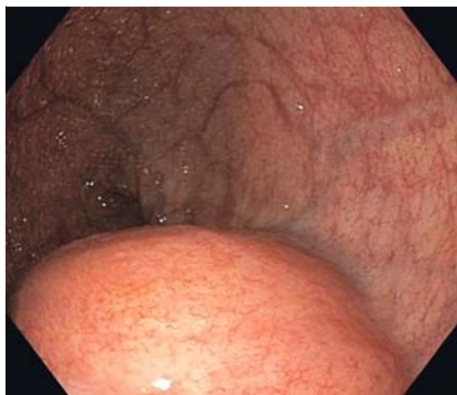
► Fig. 1 Endoscopic view of a large subepithelial lesion in the distal rectum.

We present the case of a 65-year-old woman who was referred to the Gastroenterology Department because of symptomatic intermittent rectal prolapse. The patient reported the need to manually reinsert the prolapse. Colonoscopy revealed a large subepithelial lesion in the distal rectum, adjacent to the upper margin of the anal canal (► Fig. 1). Axial contrast-enhanced pelvic computed tomography scan suggested a lipomatous lesion in the rectum. An echoendoscopy, using a dedicated anal probe (7.5 MHz), revealed a well-demarcated, hyperechoic, homogeneous lesion in the submucosa (► Fig. 2), suggesting a lipoma [5]. The patient was proposed for endoscopic resection.