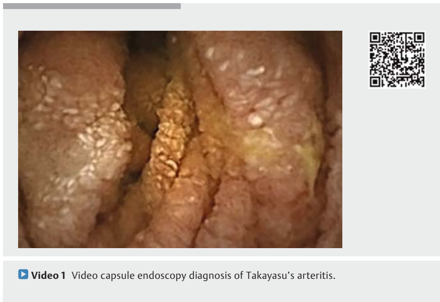
► Video 1 Video capsule endoscopy diagnosis of Takayasu's arteritis.

Capsule endoscopy showed diffuse and continuous involvement of the jejunal mucosa, with edema, reddish patches, and erosions (► Fig. 1 , ► Video 1 ). Is-