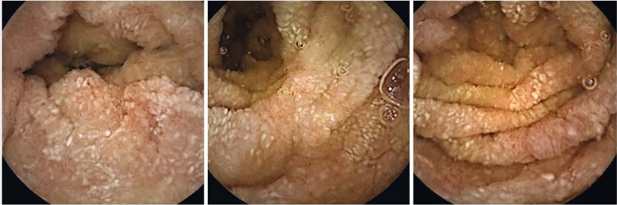
► Fig. 1 Video capsule endoscopy images. Diffuse and continuous involvement of the jejunal mucosa was seen, with edema, reddish patches, and erosions.

An asymptomatic 62-year-old woman presented for a routine annual examination and was found to have elevated sedimentation rate and C-reactive protein. Physical examination was normal except for a difference in blood pressure between arms (120/74 on the right and 110/76 on the left). Computed tomography (CT) scan demonstrated an aortitis, and positron emission tomography–CT scan confirmed the presence of active inflammatory disease. She received prednisone 40 mg daily for 30 days, but discontinued the treatment because of multiple side effects.