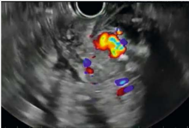
▶ Video 1 Endoscopic ultrasound-guided sclerosant injection and coil embolization of bleeding gastric varices.