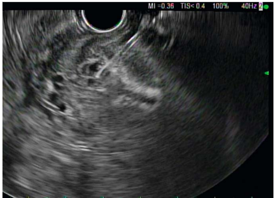
► Fig. 2 Image during endoscopic ultrasound-guided injection of the sclerosing agent and coil embolization of the gastric varices.