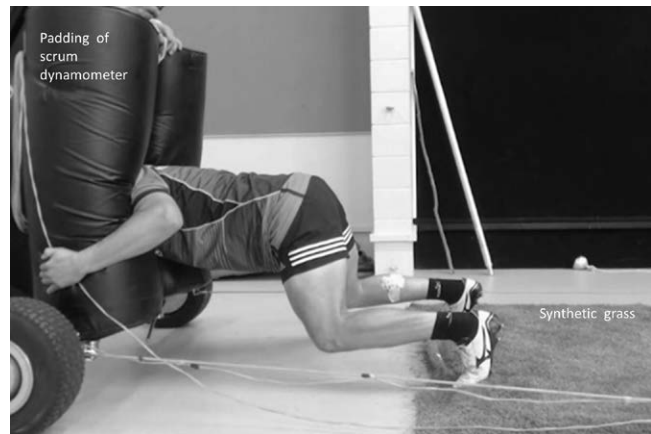
► Fig. 1 Scrum machine positioning.

The scrum force of each repetition was measured by load cell (Sensortronics, Covina, CA, USA) that was connected to the ground plate, which was attached to the main wire cable of the rugby dynamometer. The load cell was calibrated prior to the player's arrival and the force was sampled at 2 000 Hz by an acquisition system