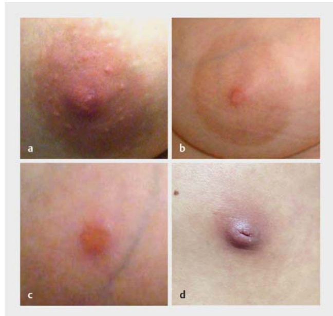
► Fig. 3 Abnormalities of nipple and areola. a Normal nipple of a 39-year-old woman; b Characteristic flat nipple of a 41-year-old patient of Group A with no glands of Montgomery in the areola; c Barely protruded nipple and absent glands of Montgomery in a patient of Group B (27 years old); d Inverted nipple without discernible areola in a 35-year-old patient of Group B.

Disorders of breast development are of great psychological importance during puberty and adolescence. The ensuing limitation on breastfeeding also deserves attention. Among the malformations with increased incidence in women with HED, unilateral or bilateral amastia is certainly the most medically relevant problem, given that it affected 43% of investigated women with non X-chromosomal HED (Group B) in our study. This indicates that mutations of the gene EDAR or EDARADD may result in more serious disturbances of breast development than EDA mutations, which is consistent with published case reports [6–8]. Further molecular