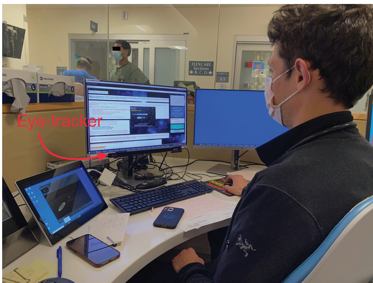
Fig. 2 Eye tracker setup.

Abbreviations: FVAS, fatigue visual analog scale; PTL, physician task load; SD, standard deviation; SSS, Stanford Sleepiness Scale.