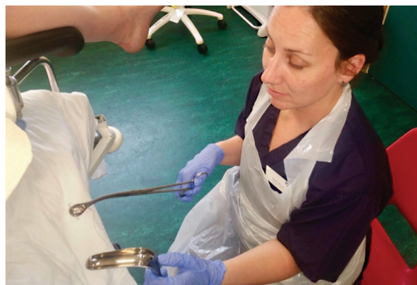
Fig. 1 Image of midwife inserting intrauterine device immediately postpartum using Kelly forceps technique.

Implementation of routine provision of IUD after vaginal birth is perhaps the most challenging of all methods to offer. The technique used to insert the IUD into the large postpartum uterus is different from that of interval insertion and requires use of long-handled Kelly forceps (→ Fig. 1) to place the IUD at the fundus. 24 As immediate postpartum IUD is not widely available, especially in high-income settings, most staff are unfamiliar with it. Due to the limited time window to insert IUDs in the immediate postpartum setting (usually