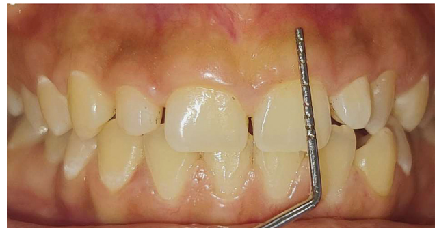
Fig. 2 Assessment of the width of the attached gingiva by demarcating the mucogingival junction.

The addition of simplified debris scores and simplified calculus scores will result in the total OHIS scores.