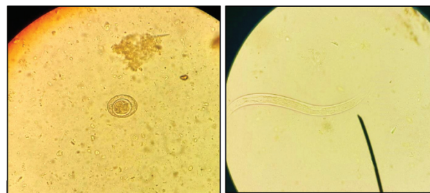
Fig. 1 Size, shape, and overall morphological features of helminths in stool specimen (400× magnification). The figure on the left demonstrates the nonbile stained egg of Hymenolepis nana in iodine mount. Egg is ovoid in shape, 35 to 45 µm in size with two membranes and hooklets. The figure on the right shows Rhabditiform larva (L1 larva) of Strongyloides stercoralis in saline wet mount. L1 Larva measures 100 to 380 µm in length with prominent genital primordium.

Note: Among 4,620 stool samples, 389 were positive for either protozoal or helminthic infections, of which Giardia duodenalis made up more than half (51.67%, 201) followed by Entamoeba histolytica (44.73%, 174).