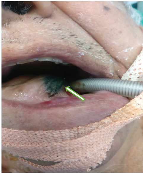
Fig. 1 Tongue ulcer over the left edge of the tongue.

three times a day. The patient was followed for 2 days, which revealed complete resolution of the tongue ulcer (► Fig. 2 ).