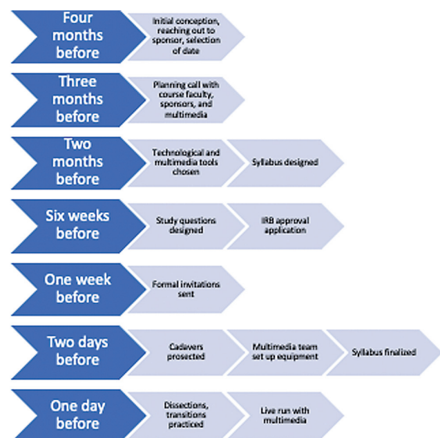
Fig. 1 Schematic of the planning process leading up to the event.

A comprehensive virtual upper extremity nerve course lasting 2 hours was performed over 1 day in fall of 2020. Preparation for this innovated anatomic dissection began 3 months in advanced and was a collaborative effort involving surgeons, surgical trainees, and a communication broadcasting team (► Fig. 1). Development of the course required a preplanning, planning, and execution phase. After developing a robust curriculum to the target audience of surgical learners, substantial effort was dedicated to delivering a high-quality broadcast in the virtual environment. Several mock dissections were performed to coordinate the audio-video-Internet needs that facilitated seamless demonstration of anatomy and simultaneous interaction with an