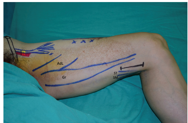
Fig. 2 Femoral nerve (FN) was identified lateral to the femoral artery (FA) in the femoral canal, beneath the inguinal ligament and with the sartorius retracted. The obturator nerve was best identified between the gracilis (Gr) and adductor longus (AdL) muscle. The incisions for the semitendinosus (ST) and semimembranosus (SM) tendons were made more distally posterior to the gracilis tendon.

made over the femoral canal from below the inguinal crease to the sartorius muscle. The sartorius was retracted laterally to expose the neurovascular bundle, where the femoral nerve lied lateral to the artery (► Fig. 2 ). The nerve trifurcated into (1) medial sensory branch, (2) motor branches into VM and