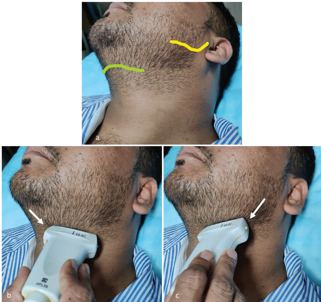
Fig. 1 (a) Clinical Photograph showing the surface markings for hyoid bone (green line) and angle of mandible (yellow line) that are used as landmarks during the procedure. (b, c) Clinical photographs showing the position of ultrasound probe, that is initially kept along the lateral end of greater horn of hyoid bone (arrow in b) and then tilted counterclockwise so that the lateral end of the probe lies near the angle of mandible (arrow in c).