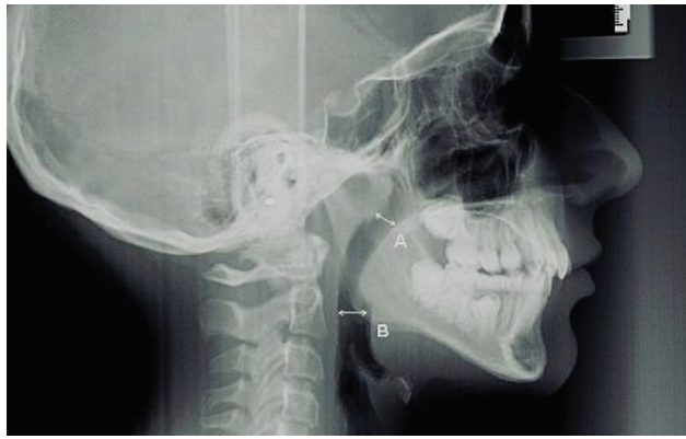
Fig. 1 Digital lateral cephalogram showing distance of epiglottis from the tip of the soft palate (A) and distance of posterior pharynx from the tip of the epiglottis (B).