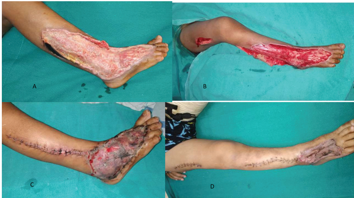
Fig. 1 (A) Leg wound at presentation. (B) Wound debridement and exploration of proximal necrosed deeper layer of fat of leg with overlying intact skin and superficial layer of fat. (C) Immediate postoperative, with primary closure of exploratory incision and skin grafting over wound. (D) 10 days postoperative after primary closure and satisfactory skin graft uptake.