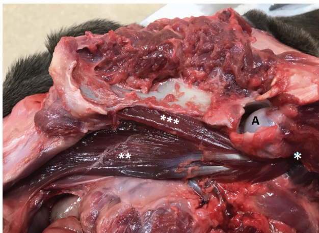
Fig. 1 The letter A marks the head of the femur. The single white asterisk indicates the lesser trochanter. The three white asterisks annotate the iliopsoas m. coursing toward its origin. The two white asterisks highlight the psoas major m. tracking toward its origin.

Paired pelvic limb specimens ( n=8 ) were evaluated from one female and three male dogs, which were euthanatized for reasons unrelated to this study, which, thus, did not require institutional ethical committee approval. All specimens were from adult mixed breed dogs with an average weight of 26 kg (range: 23–30 kg). The specimens were stored at -25^{\circ}\text{C} and were thawed over a 48-hour period. Dissection and data collection were accomplished within 60 hours of complete thawing to minimize any variables associated with decomposition.