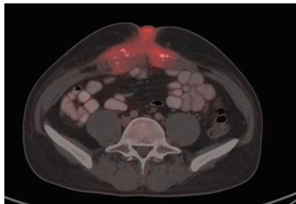
Figure 2: PET CT scan showing nodular lesion at umbilicus and omental nodules in sub hepatic region.

(PET)-CT scan reported soft tissue density lesion in right anterior abdominal wall nodular lesion at umbilicus and omental nodules in subhepatic region (→ Fig. 2 ) Core biopsy from the mass was suggestive of metastatic carcinoma. Immunohistochemistry was CK7, CK20, CK19, and 34BE12 positive and B-catenin diffuse cytoplasmic positivity in tumor cells with possibility of (1) primary from pancreaticobiliary or (2) urachal adenocarcinoma (→ Fig. 3A-D ). In view of clinicoradiological findings, raised tumor marker and presence of omental metastases patient was planned for