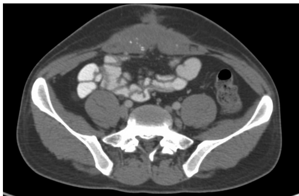
Figure 1: Contrast enhanced CT scan Abdomen showing umbilical lesion.