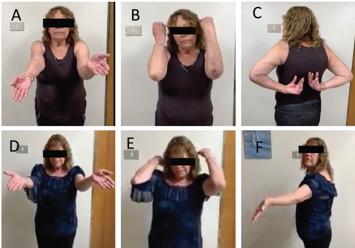
Fig. 2 Postoperative result of complex elbow fracture-dislocation. Case report. (A) Extension, flexion, and flexion with supination and internal rotation of the shoulder three weeks postoperatively. (B) Flexion and extension 12 weeks postoperatively.

children. 1,2 However, as they differ from the pediatric population, in the adult population, both the mechanism and type of fracture-dislocation, the patient comorbidities, the previous functional capacity, the type of approach, and the anatomical structures to be repaired are variables to consider for the definitive treatment. 1,4,9 This emphasizes the importance of reporting this type of injury in the adult population.