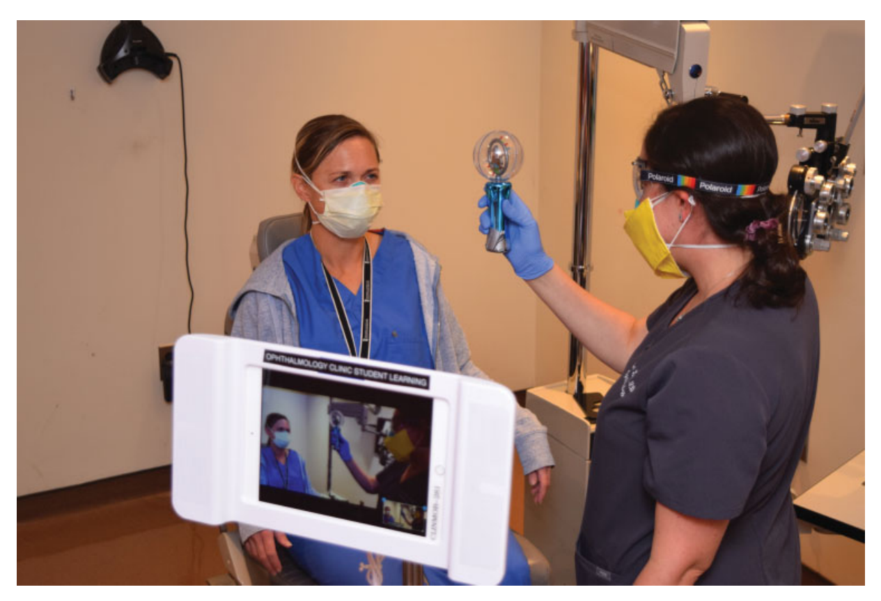
Fig. 3 Virtual students were able to observe clinical encounters in the clinic.