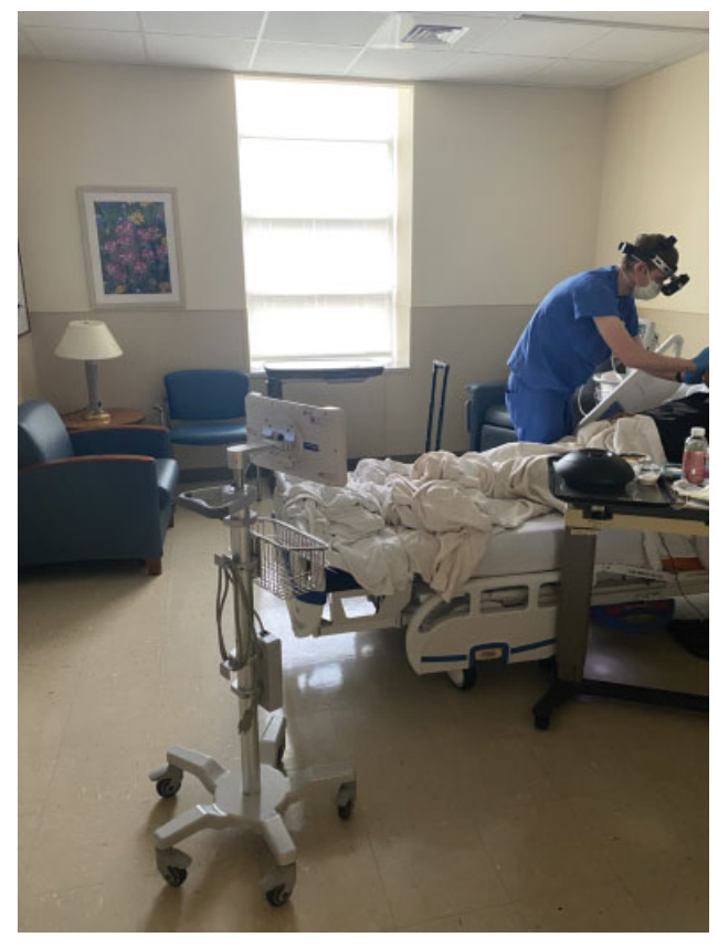
Fig. 2 Residents verbalized physical exam findings to allow virtual students to come up with live-time assessment and plans for patient.