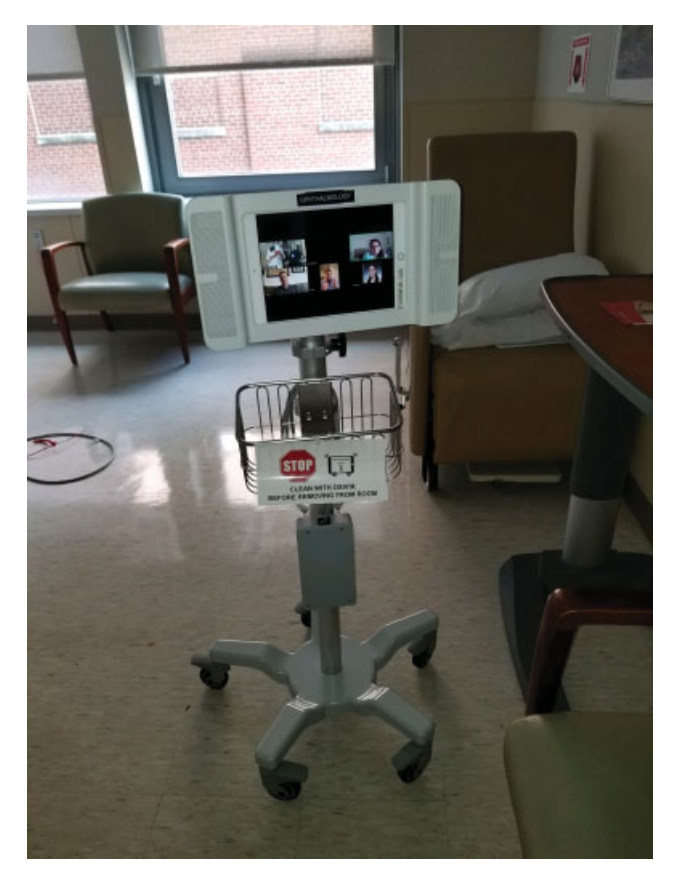
Fig. 1 Mobile iPads were allowed students to virtually attend consults throughout the hospital.