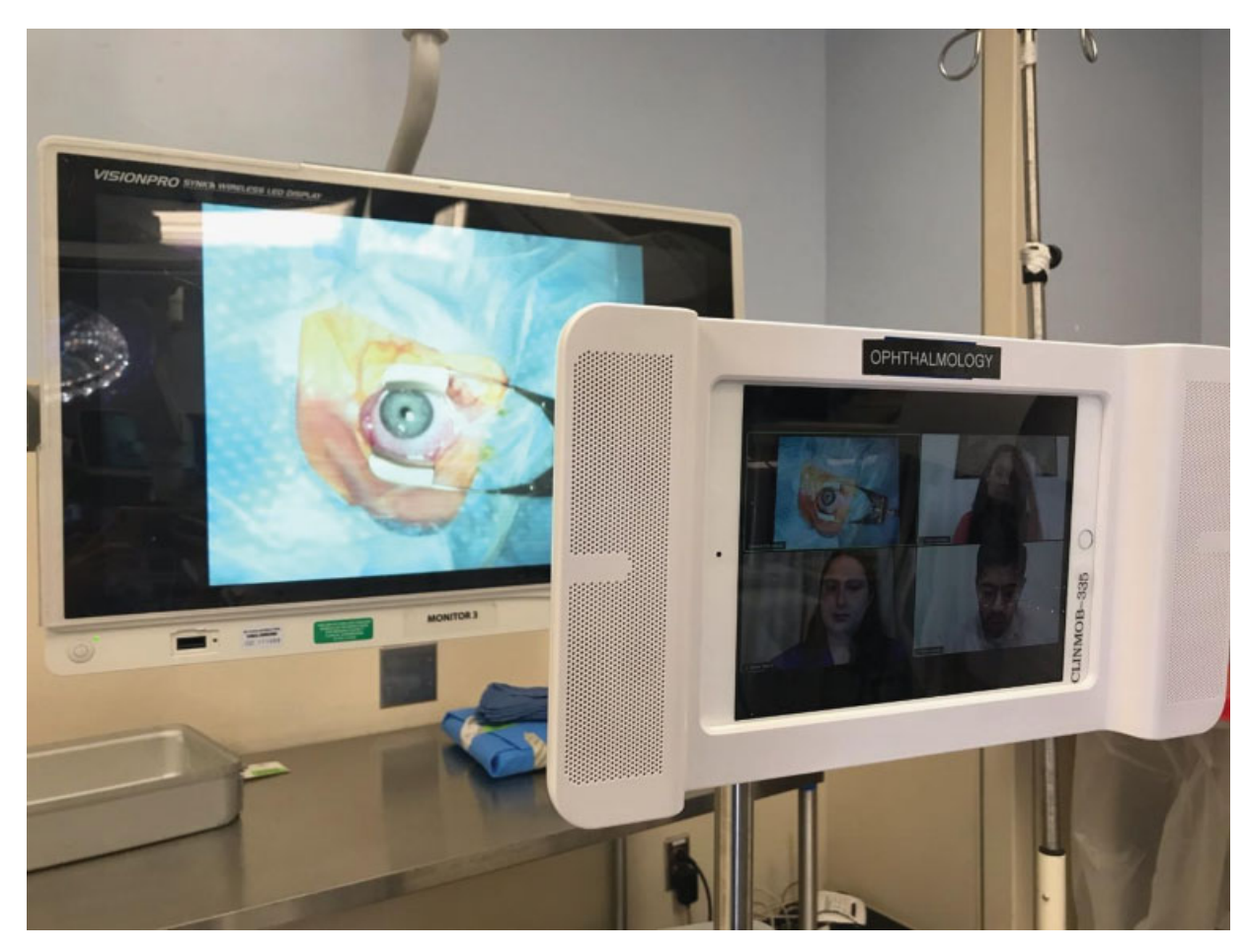
Fig. 6 iPad devices were placed to allow students to view surgeries in real time in the operating room. Devices were also placed close enough to allow engagement between the virtual students, residents, and attending physicians.

faculty. Topics include pediatric ophthalmology, acute vision loss, chronic vision loss, oculoplastics, and neuro-ophthalmology.