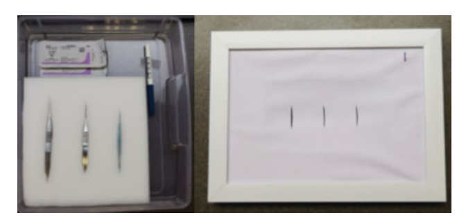
Fig. 8 Wet laboratory kits were received by students and used for virtual suturing instruction.

The authors thank the University of Maryland Clinical Mobility Team for technical support and the use of mobile iPads for this project.