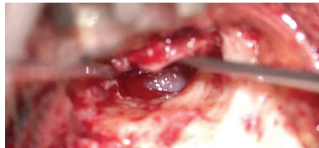
Fig. 1 Edited showing the tumor after elevation of the tympanomeatal flap.

The extent and margin of the tumor were examined all around. The drilling commenced in the posterosuperior region of the external auditory canal and the outer attic wall to expose the ossicles. → Fig. 2 The tumor could then be easily dissected around the ossicles, thus preserving the hearing. Thereafter, the drilling was performed judiciously in the posteroinferior part as the facial nerve runs lateral to the tympanic annulus in this region. The hypotympanic air cells were then exposed, and the tumor was delineated all