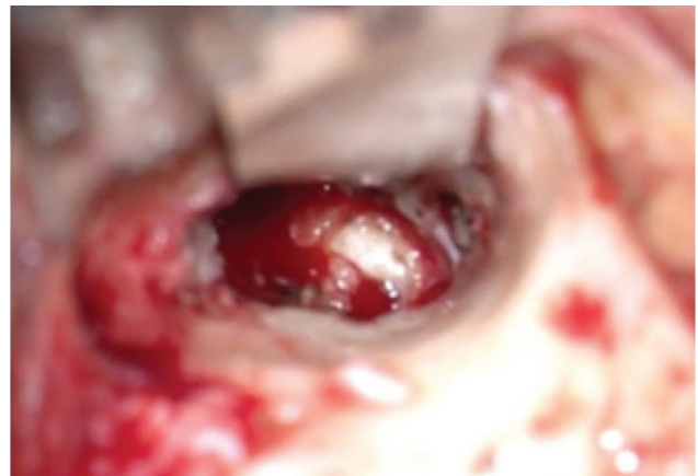
Fig. 5 Edited showing the ossicular chain, stapedius tendon and round window niche after tumor removal.