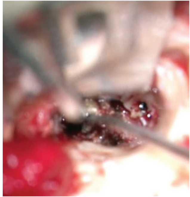
Fig. 4 Edited showing the dissection of the lesion from the promontory. The incudostapedial joint and stapedius tendon are seen.

If the tumor extended medial to the ossicles, the incus was dislocated from the stapes and removed to gain access. Tympanoplasty was performed, and the canal was packed with medicated gel film. The patients were alerted regarding the possibility of bleeding, hearing loss, facial nerve paralysis, taste disturbance, and tympanic membrane perforation. The follow-up protocol consisted of a computed tomography of the temporal bone with contrast at the end of 3 months to rule out any recurrence of the tumor. Those with persistent symptoms of tinnitus underwent computed tomography after 6 months