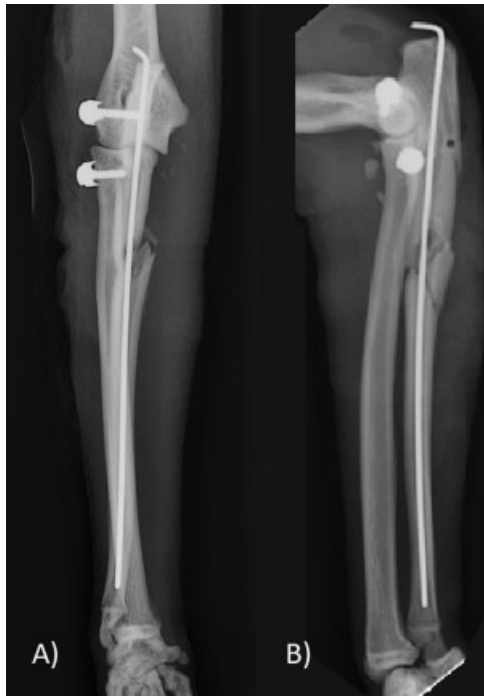
Fig. 3 Postoperative (A) craniocaudal and (B) lateral radiographs reveal a reduction in the ulnar fracture with a good bone alignment. Anatomic relationships between the radius, ulna and humerus have been restored. Bone fragments are still visible on the craniomedial edge of the elbow joint.

(175 degrees in extension and 10 degrees in flexion), without any associated pain. Normal range of motion of the elbow joint was observed in pronation and supination movements. Thanks to the owners' compliance, the cat presented at 8 postoperative months and 2 postoperative years without any significant elbow joint X-ray changes in comparison with the 16-week visit (►Figs. 4A and 4B). Perfect stability of the elbow joint was confirmed with Campbell's tests and flexion and extension movements. Only slight, non-persistent lameness was reported by the owners (a video was transmitted by the owners showing the gait described).