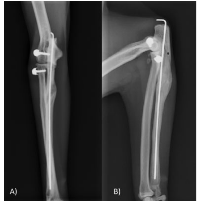
Fig. 4 Sixteen-week postoperative (A) craniocaudal and (B) lateral radiographs revealed a complete healing of the fracture with all the implants in place. No sign of osteoarthritis was noted.

Giovanni Batista Monteggia first described Monteggia lesion in 1814 as fractures of the proximal third of ulnar diaphysis and luxation of the radial head. These are very uncommon presentations for ulna fractures, and little information about their frequency has been reported in veterinary medicine. Out of 25 radio-ulnar fractures, a single case is cited in the study by Phillips, representing 3% of cases. In human medicine, Monteggia fractures represent 7% of radio-ulnar fractures—though only 0.7% when elbow joint dislocation is considered. 7 In 1967, José Luis Bado presented four Monteggia lesion types, according to radial head displacement and ulnar fracture angulation (►Fig. 5). 4 Type I is the most frequent presentation in both humans and animals, and is defined as a cranial radial head luxation and cranio-proximal angulation of the ulnar fracture. Type II is the least frequent presentation and combines a caudal radial head displacement with caudal ulnar fracture angula-