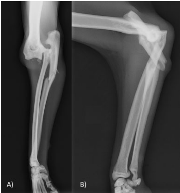
Fig. 1 (A) Craniocaudal and (B) lateral radiographs of the right antebrachium showed an ulnar diaphyseal fracture with a butterfly fragment and a complete elbow joint dislocation. Bone fragments are visible on the craniomedial edge of the elbow joint.

fracture, with concurrent humero-ulnar joint luxation. Cranio-medial bone fragments were also visible on the antero-posterior radiographic view.