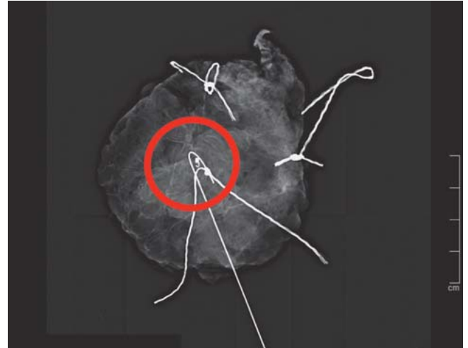
► Fig. 3 Intratumorous localization of the marker clip by specimen x-ray. Specimen x-ray (with radiopaque threads for specimen orientation) was performed immediately after breast-conserving surgery, and the marker clip was visualized in the proven intramammary lesion without evidence of clip migration (red circle). The pathologic result was invasive breast cancer of no special type, and a clear tumor margin was observed.

of 24% (n=6). There was no difficulty in the pathological evaluation of a specimen due to the inserted marker clip. Among the 25 surgical procedures performed during the study period, no cases were identified in which intraoperative loss of the marker clip had occurred.