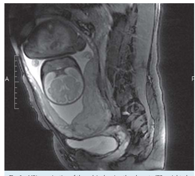
Fig. 1 MRI examination of the pelvis showing the placenta (T2-weighted images, sagittal).