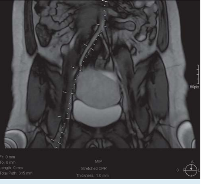
Fig. 2 MRI examination of the pelvic vessels (T2-weighted images, coronal).

postpartum hemorrhage. These successes were confirmed in further studies [18, 21].