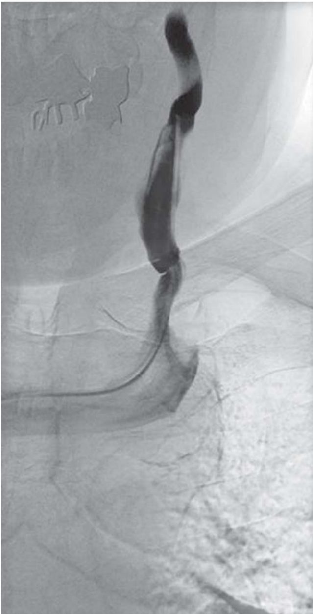
Fig. 2 DSA-image during blood sampling with catheter in left internal jugular vein.

was below the confluence of both brachiocephalic veins. Bilateral exploration was only performed if there was a significant bilateral peak (1/18) or there was a peak in the region of the inferior thyroid vein (3/19). In the latter case, however, only the caudal parathyroid gland was explored. Further exploration occurred if no adenoma could be found after an initial targeted procedure (2/19). In total, 18 of the 19 patients (95%) could be successfully operated on. The following histological results were observed: solitary adenoma (13/18), 2 adenomas (1/18), one or more hyperplasias (3/18), hyperplasia and adenoma (1/18).