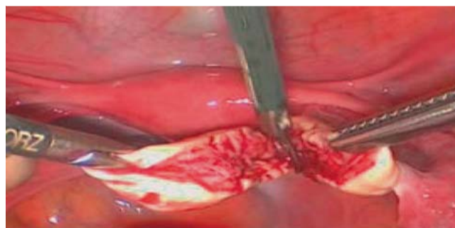
Fig. 2 Surgical site: Removal of a part of the ovary for cryopreservation.

The case report presented above describes a deviation from the standard treatment for bilateral ovarian seromucinous borderline tumour due to the individual situation of our 25-year-old patient's pronounced desire to become pregnant. In consensus with