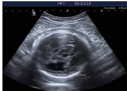
Fig. 1 Microcephaly and ventriculomegaly in a 31-weeks ZIKV affected fetus in Brazil.

Sporadic reports were published until the end of 2015, when several cases of congenital microcephaly were reported in Brazil, in association with a Zika outbreak [23, 24]. The first recorded cases in Brazil were reported in June 2015, originally in an area endemic for Dengue fever [25] and soon several reports followed, including cases from Venezuela [26] and Colombia [27].