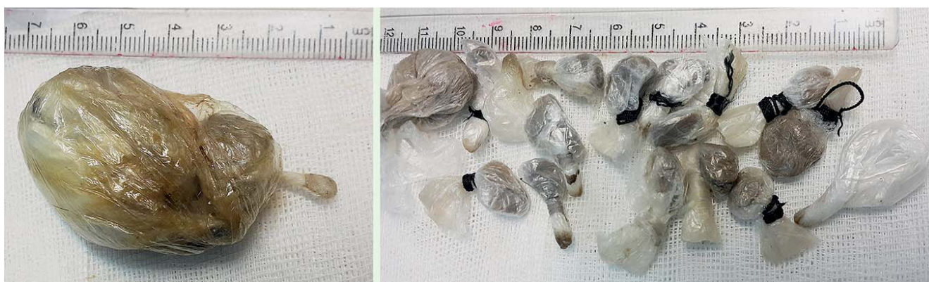
Fig. 2 The packs retrieved from the same patient after upper gastrointestinal endoscopy. Left: The main pack. Right: Baggies inside the main pack.

In general, serious complications following body stuffing are rare and there is no consensus on the best method for removing baggies that contain huge life-threatening amounts of drugs [6]. Although endoscopic removal of drug packets is highly controversial, some reports exist of success with the procedure [7–9]. The risk associated with this approach is primarily packet perforation,