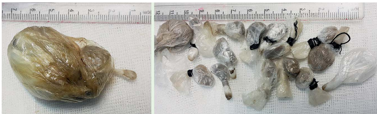
Fig. 2 The packs retrieved from the same patient after upper gastrointestinal endoscopy. Left: The main pack. Right: Baggies inside the main pack.

In general, serious complications following body stuffing are rare and there is no consensus on the best method for removing baggies that contain huge life-threatening amounts of drugs [6]. Although endoscopic removal of drug packets is highly controversial, some reports exist of success with the procedure [7–9]. The risk associated with this approach is primarily packet perforation,