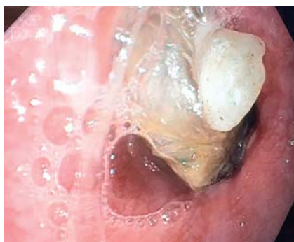
Fig. 3 View of a baggie during endoscopy

which can release dangerous amounts of drug and even cause death. Endoscopic removal typically has been attempted in body packers who have multilayer well-wrapped packets. Hoffman and Nelson believe that endoscopy may be safe when performed in a highly controlled setting, especially when a packet can be tested for strength against the snare. However, they believe that only asymptomatic patients are candidates for endoscopy when whole bowel irrigation has failed or is otherwise contraindicated [10].