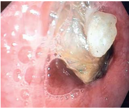
Fig. 3 View of a baggie during endoscopy

which can release dangerous amounts of drug and even cause death. Endoscopic removal typically has been attempted in body packers who have multilayer well-wrapped packets. Hoffman and Nelson believe that endoscopy may be safe when performed in a highly controlled setting, especially when a packet can be tested for strength against the snare. However, they believe that only asymptomatic patients are candidates for endoscopy when whole bowel irrigation has failed or is otherwise contraindicated [10].