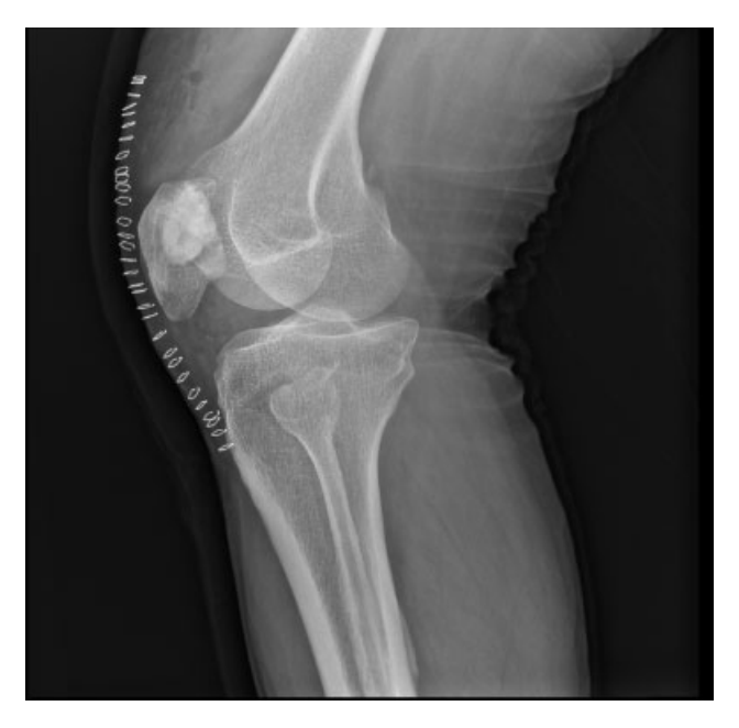
Fig. 2 X-ray lateral view showing lesion filled with bone cement.

He underwent curettage and bone cement application (>Fig. 2). Histopathology from the right patellar lesion showed fibrocollagenous tissue with the presence of inflammatory cells and a neoplasm. The neoplasm was composed of clear cells