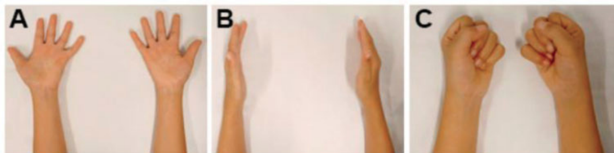
Fig. 3 Morphology of the upper limb after conservative treatment for 23 and a half months. Supine position with the fingers in extension (A), side view (B), fingers in flexion (C).

In this case of rigid type-III camptodactyly in children with Beals-Heacht syndrome, early intervention 9 with static orthoses provided a satisfactory outcome with the regression of the deformity and the achievement of functional use of the