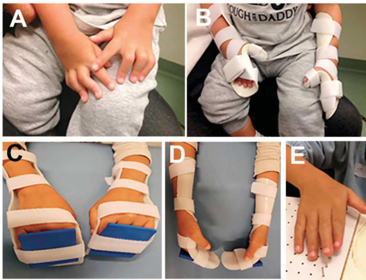
Fig. 2 Demonstration of the evolution of the conservative treatment of the patient with camptodactyly. Beginning of the correction (A), positioning orthosis with maintenance of the dorsal support (B), nocturnal orthosis with free thumbs and ethylene-vinyl acetate (EVA) plate in the dorsal region of the fingers (C), nightly use of orthosis in lateral view (D) and complete extension of fingers (E).

PIP joint flexion, wrist flexion and MCP joint hyperextension, achieved in February 2015 (►Fig. 2 A-E).