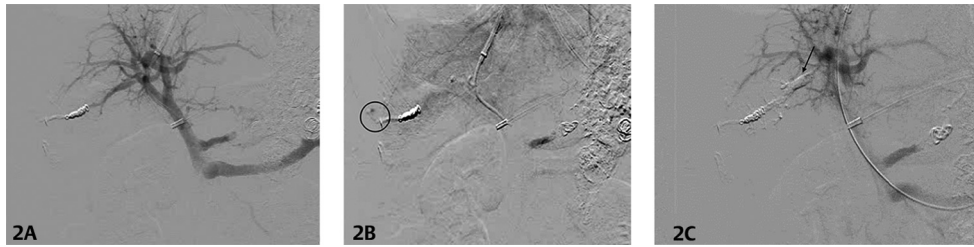
Fig. 2 (A) DSA image showing portal venogram (early phase) performed via the trans-jugular route. No contrast extravasation seen. (B). DSA image showing portal venogram (delayed phase) performed via the trans-jugular route. Active contrast extravasation (encircled) from the portal vein branch that was punctured for antegrade access. (C) DSA image taken post-procedure showing the glue cast (arrow) in the portal vein branch. No residual contrast leak seen.

will obscure the site of rebleed. Diagnostic angiography has to be ultimately performed to confirm the exact site of bleed. Once the culprit portal venous branch is identified, it must be embolized to stop the ongoing bleeding.