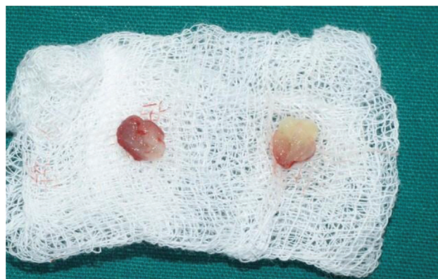
Fig. 2 Platelet-rich fibrin (PRF) is squeezed between the sterile gauze pads.

Preparation for PRF production follows a standard protocol, as described by Choukroun et al. 1 A total of 5 mL of whole venous blood is drawn with anticoagulant in 10 mL tubes and immediately centrifuged at 3000 rotations per minute (rpm) for 10 minutes. The blood is contacted with the test tube wall during the centrifuging process, leading to the activation of