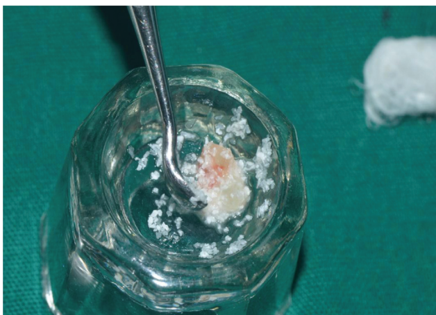
Fig. 4 Platelet-rich fibrin mixed with bone graft ready for loading in surgical site.