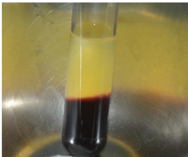
Fig. 1 Platelet-rich fibrin (PRF) in test tube after centrifuging showing platelet-poor plasma, PRF clot, and red blood cells (RBCs).

provides a rich source of growth factors, which includes platelet-derived growth factors, transforming growth factors, vascular endothelial growth factor, and insulin-like growth factor. 2 The growth factors are gradually released during the time of the healing. PRF is used in dentistry due to its unique healing potential. 3,4