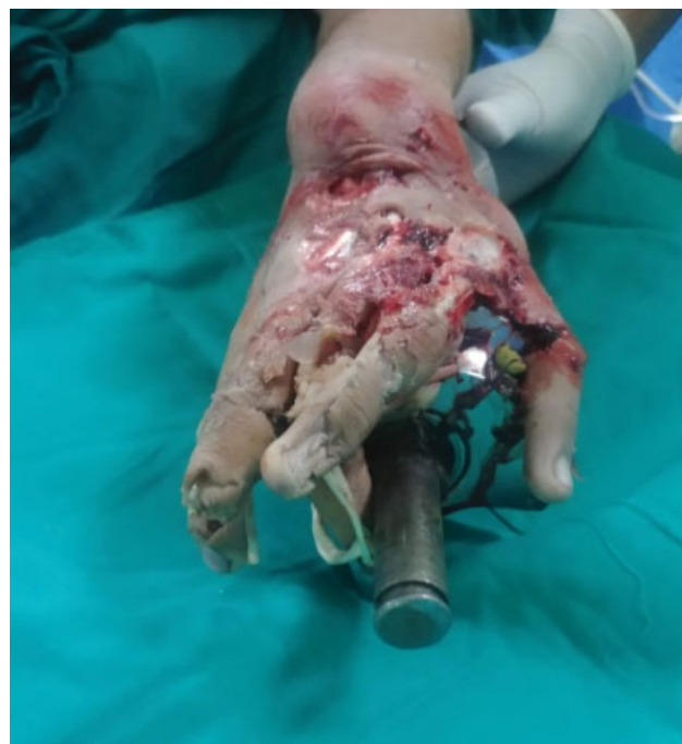
Fig. 3 Dorsal view of the left hand after removal of the outer shell.

Hands are an essential component of our existence. They are not only important for physical and psychological development but also play an essential role in our appearance and our professional career. 2 It is no surprising that injuries to the hands can have devastating consequences for an individual.