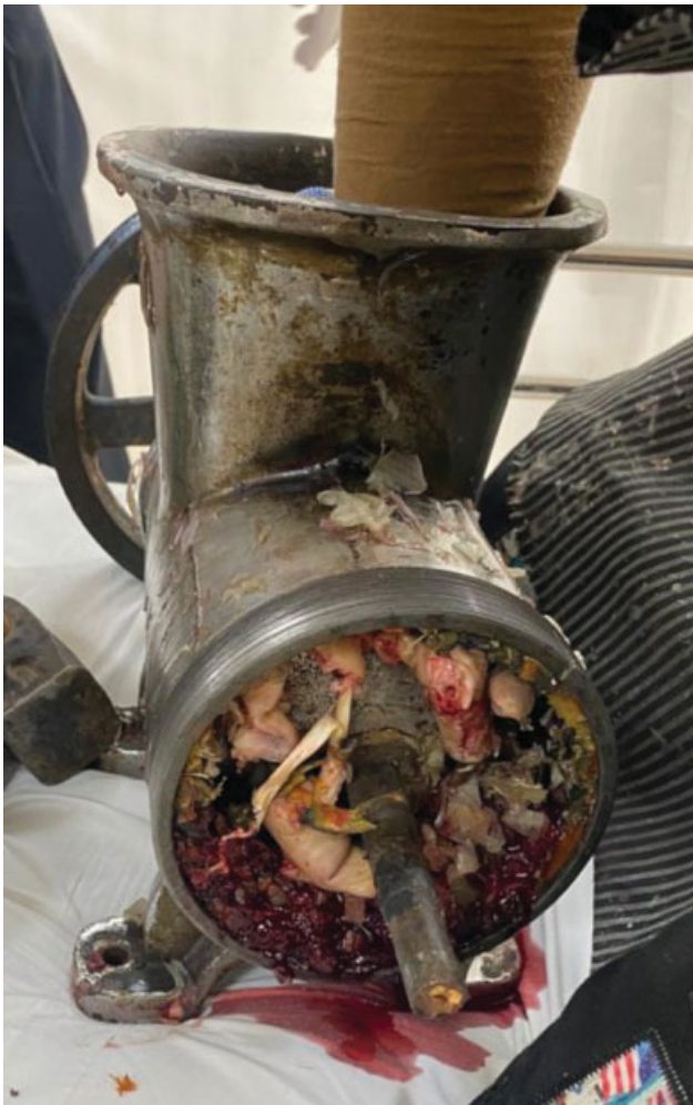
Fig. 6 The right hand caught within the meat grinder, with visible crushing of hand.

workplace, especially for those who are inadequately trained in their proper use. 4