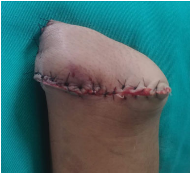
Fig. 5 Postdisarticulation volar view.