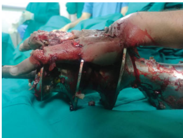
Fig. 2 Lateral view of the left hand after removal of the outer shell.

After an uneventful postoperative period, suture removal was done at 14 days and currently the patient wears a cosmetic prosthesis.