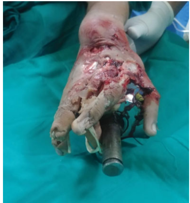
Fig. 3 Dorsal view of the left hand after removal of the outer shell.

Hands are an essential component of our existence. They are not only important for physical and psychological development but also play an essential role in our appearance and our professional career. 2 It is no surprising that injuries to the hands can have devastating consequences for an individual.