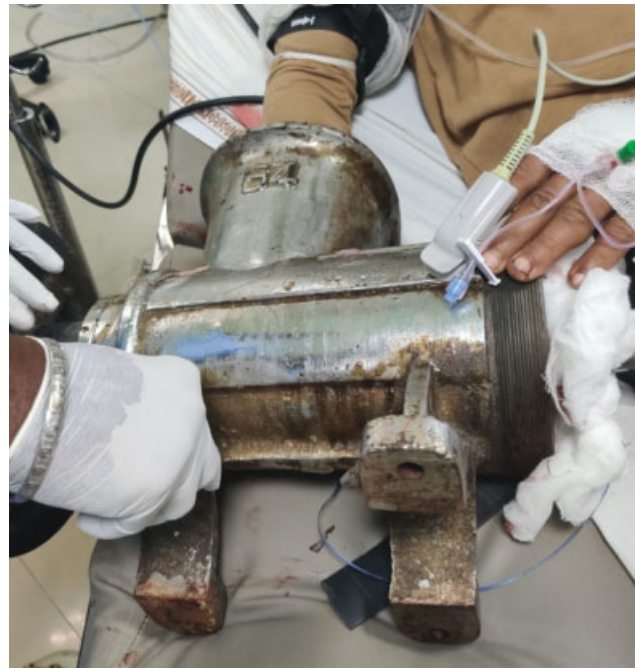
Fig. 7 The right hand caught within meat grinder.