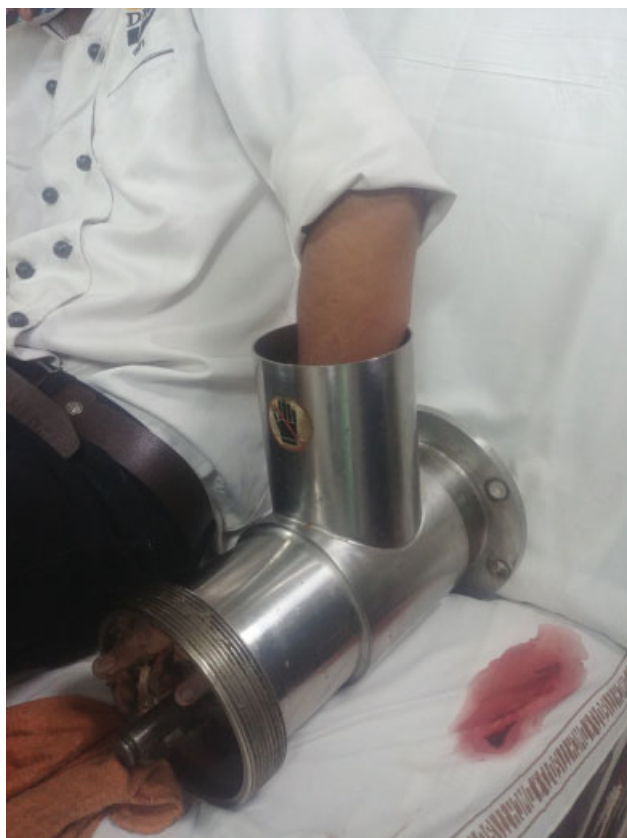
Fig. 1 The left hand caught within the meat grinder.