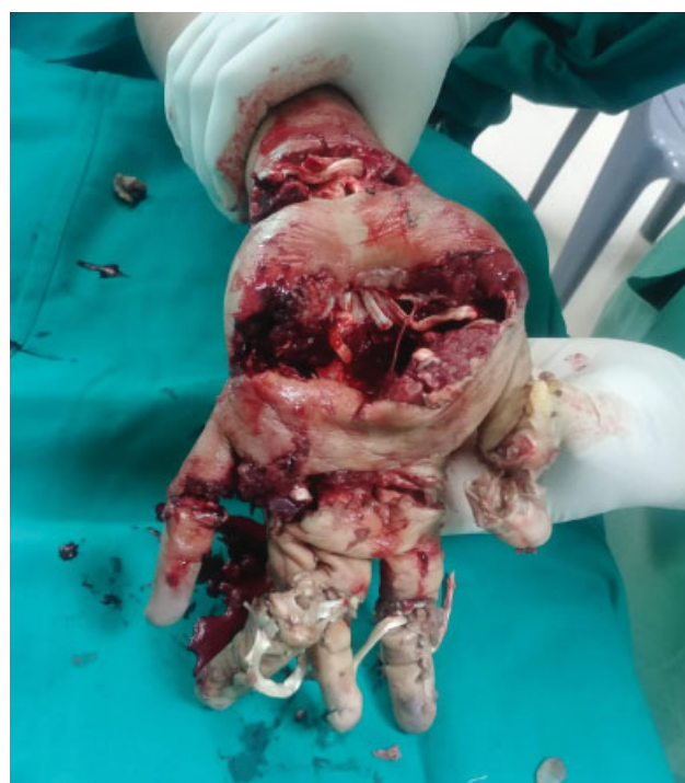
Fig. 4 Palmar view of the left hand after removal of the outer shell.

Loss of just the thumb is equivalent to a 40% loss of hand function and a 25% loss of the whole body. 3