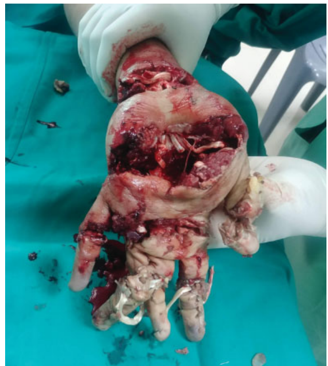
Fig. 4 Palmar view of the left hand after removal of the outer shell.

Loss of just the thumb is equivalent to a 40% loss of hand function and a 25% loss of the whole body. 3