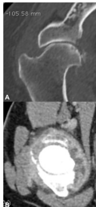
Fig. 2 Computed tomography of the right shoulder. (A) Large amount of rough and irregularly outlined new bone formation. In the caudal aspect of the joint, a large amorphous mineral area that was not in contact with any osseous structure was observed. A thin linear mineral flap is also observed in the cranial aspect of the joint. The articular surface within the entire joint was slightly irregularly outlined. (B) The joint was severely distended, and the joint capsule thickened and intensely enhanced following intravenous contrast administration.

A shoulder joint arthroscopy via lateral approach was performed to explore and to obtain tissue samples (►Fig. 3). A focal defect of the cartilage and subchondral bone on the caudal humeral head was found, compatible with OCD (►Fig. 3A), as well as severe proliferative synovitis and eburnation on the glenoid cavity. The cranial compartment of the joint, including the bicipital tendon, could not be seen due to the severe synovial proliferations in this location. Samples of cartilage with subchondral bone from the caudal humeral head defect and synovial membrane were taken for histological analysis and microbiological culture with