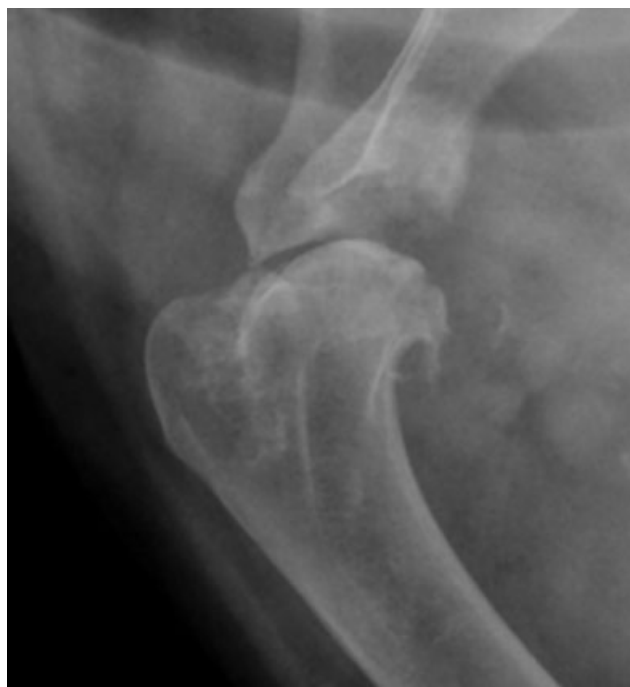
Fig. 1 Radiograph of the shoulder joint, mediolateral view. Ill-defined punched-out osteolysis and new bone formation at the articular surface of the caudal glenoid cavity and humeral head with adjacent subchondral bone sclerosis, with mineral opacity in the bicipital groove. The joint seemed distended.

caudal aspect of the humeral head, caudal border of the glenoid cavity, at the distal tip of the supraglenoid tubercle and along the bicipital groove (►Fig. 2A). The spontaneous attenuation of the joint effusion was high (20–40 Hounsfield unit, ►Fig. 2B). In the caudal aspect of the humeral head, several small, round-shaped hypoattenuated defects were visible in the subchondral bone, surrounded by substantial sclerosis.