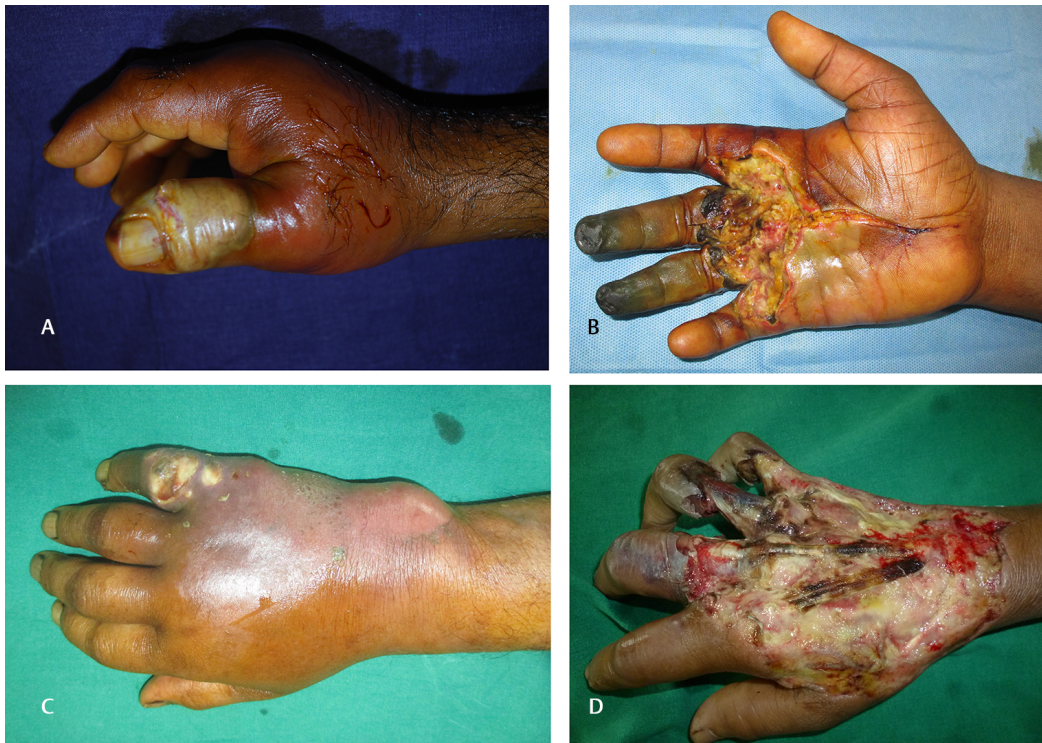
Fig. 1 (A, B, C and D) Varied presentation ranging from paronychia to necrotizing fasciitis.

underwent two or more surgeries. Flap division and surgical syndactyly separation were excluded from this count. Seven patients needed repeat debridement, and 17 patients underwent reconstructive surgery in the form of tendon repair (1), split thickness skin grafts (5), local transposition flap (1), cross finger flap (3) and groin/hypogastric flap (7) (►Figs. 3, 4 and 5, 4 and 5). Primary flap cover was done in 3 out of the 11 patients who underwent flap cover. In the other eight patients, the mean time interval between debridement and flap cover was 15 days. The skin grafts showed 100% take, and all the flaps survived. The mean duration of hospital stay was 6 days.