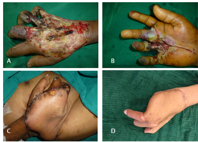
Fig. 5 (A and B) A 56-year-old lady presented to us with gangrene of the medial three fingers of her right hand following a thorn prick injury sustained 15 days earlier. (C) Debridement, amputation of the ring and little fingers with a pedicled abdominal flap cover were done. (D) 7 years follow-up picture.

for the hand infection. Three years after the hand infection episode, he underwent left below knee amputation elsewhere for diabetic foot ulcer and expired 3 weeks post amputation.