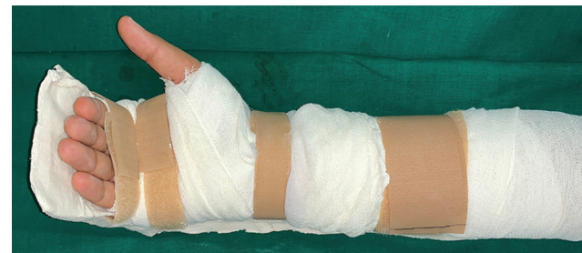
Fig. 3 Final application of splint