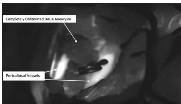
Fig. 1 Indocyanine green video angiography depicting complete obliteration of distal anterior cerebral artery (DACA) aneurysm.

Compared with other studies, our study showed lower discrepancy between intraoperative ICG angiography and postoperative DSA results. Complete aneurysm obliteration was seen in 100.0% of patients in intraoperative ICG findings and 90.0% of patients in postoperative DSA. p -Value of 0.237 was found that was statistically nonsignificant. Residual neck was seen in 10.0% of patients in postoperative DSA findings and none in intraoperative ICG findings. Parent vessel