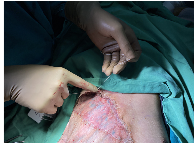
Fig. 2 Surgical knot tied with the linen thread over the staple.