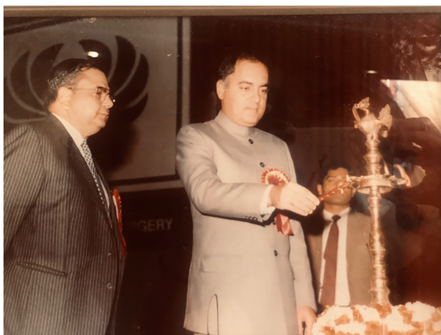
Fig. 6 Inauguration ceremony of International Confederation for Plastic Reconstructive and Aesthetic Surgery (IPRAS) 1987 Congress with Shri Rajiv Gandhi, the Prime Minister of India, as the Chief Guest.