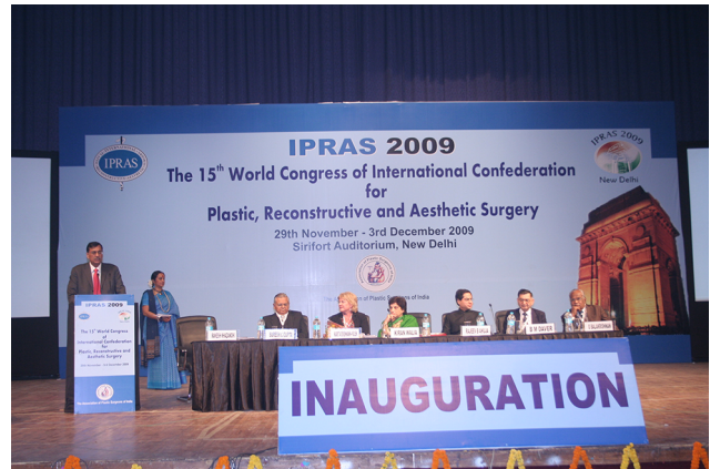
Fig. 8 Inaugural ceremony of International Confederation for Plastic Reconstructive and Aesthetic Surgery (IPRAS) 2009. Chief guest is Ms. Kiran Walia, Hon'ble Minister for Health, Govt. of NCT of Delhi.