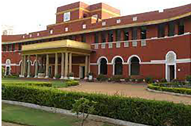
Fig. 2 Modern School, Barakhamba Road, New Delhi.