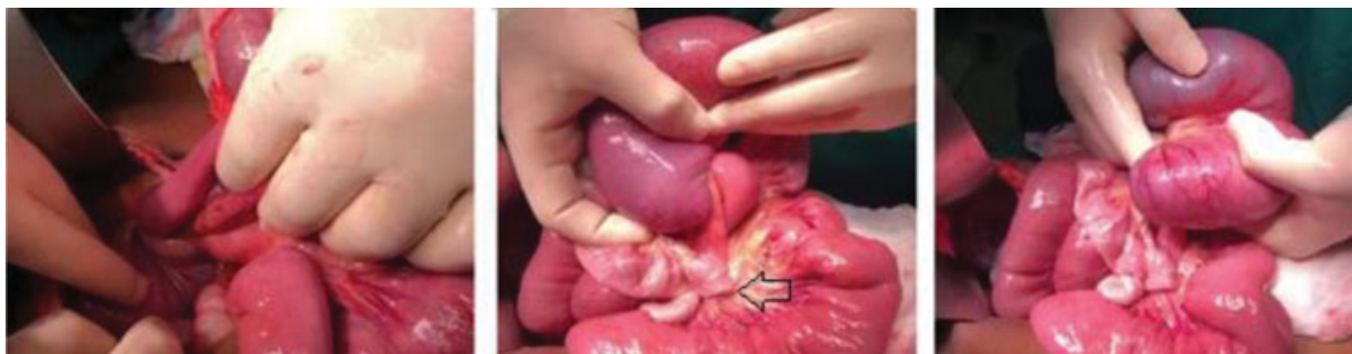
Fig. 2 Intraoperative image of the bowel. Images show volvulus of an ischemic segment with flat proximal and distal ends.

The clinical presentation can be deceiving. Internal hernia can be asymptomatic for years or present with nonspecific