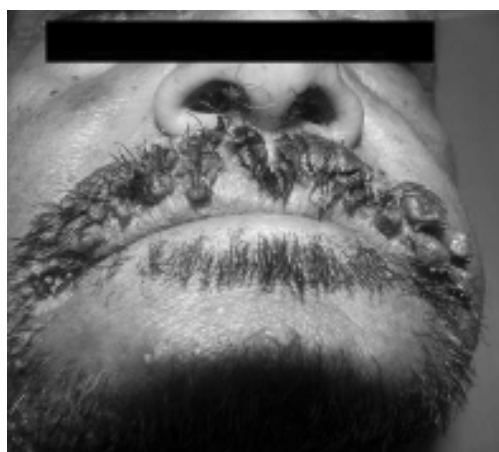
Fig 3: Gefitinib induced rash

Palliative treatment options available for recurrent/metastatic HNSCC are limited. The impact on disease stabilization during