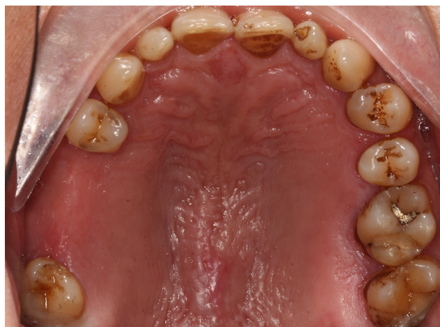
Fig. 2 Healing after 14 days postexcisional biopsy and trectomy.