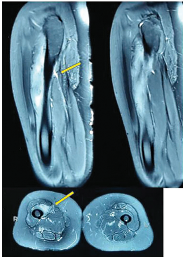
Fig. 1 Metastatic lesion in vastus intermedius (yellow arrow).

adenocarcinomas, whereas squamous cell carcinomas have a tendency to locally invade the thoracic wall. 1 Major sites of metastasis are brain, bone, liver, and adrenals. Hematogenous metastasis to skeletal muscle is very rare, even in autopsy studies. Out of 500 autopsies conducted by Willis in carcinoma patients, only four were found to have skeletal muscle metastasis. 2 Even the cancers, which commonly metastasize to the bone such as prostate, breast, and thyroid cancers, only rarely disseminate to soft tissues. 3 According to one of the hypotheses, muscle contractions may prevent metastasis by inducing a high tissue pressure and variable local blood flow, thereby discouraging implantation of tumor cells. 4 According to prior Wittich in 1854 provided the first description of a muscle metastasis and Willis was the first to report a muscle metastasis of lung origin. 5 In their case series, Koike et al reported seven cases of carcinoma presenting with skeletal muscle metastases. Four of them were found to have pulmonary origin, of which two were adenocarcinomas and two squamous cell carcinomas. 6