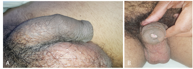
Fig. 4 A 3 years follow-up result—(A) Right lateral view. (B) End-on view showing complete glans coverage and healthy neoprepuce.

Circumcision has been performed since past 6000 years, mainly for religious and medical indications. Based on the identifying feature of a circumcised glans, these individuals have often been subjected to minority stress and oppression. To escape this persecution, some of these individuals underwent the operation of prepuce reconstruction. Celsus was the first to describe two such procedures between CE 14 to 37 in De Medicina (7.25.1). 3,4 For those with a short prepuce, which was mostly retracted and unable to cover the glans fully, naturally, he suggested the operation of prepucial reconstruction, in which a circumferential incision was given at the root of penis, with extensive forward mobilization of penile shaft skin and distal edge sliding ahead of glans, thus forming an epithelial lined prepuce, which was retained anterior to glans with the help of a tie at distal edge. The denuded penile shaft was dressed till healing by second intention. For those patients who had undergone prior circumcision, he used a pericoronal approach, mobilizing the penile skin superficial to Buck's fascia and stretching it till it covered the complete glans. This formed a prepuce with raw glanular surface, which was dressed till healing by second intention. He called this procedure "decircumcision." Both these procedures left