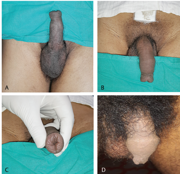
Fig. 3 Same patient as in Fig. 1. One-week postoperative result with some residual edema—(A) Ventral view of penis and neoprepuce. (B) Dorsal view. (C) End-on view showing complete glans penis coverage. (D) One year and 4 months postoperative view.

these patients had loss of definition of neoprepuce. None of the patients had complications like meatal stenosis, urinary infection, balanitis, or posthitis. No patient reported concerns in relation to hygiene of neoprepuce. Penile erections and nocturnal/early morning penile tumescence were unaffected by the procedure and painless. Due to the religious propensity of these patients, the sexual activity and penile performance during intercourse could not be evaluated.