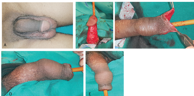
Fig. 1 (A) Patient with congenitally short prepuce and exposed glans penis. Preoperative status. (B) Penile shaft degloved in loose subdartos plane, up to base. (C) Penile shaft skin advanced nearly 5 cm beyond glans tip. (D) Neoprepuce created with described method, lateral view. (E) Dorsal view.

With patient in supine position under spinal anesthesia, pericoronal incision was given. The prepuce remnant, when present, and penile shaft skin were mobilized in the subdartos loose areolar plane to penile base (►Fig. 1). The penile skin dartos flap, well vascularized by superficial and deep external pudendal vessels, could now be advanced well beyond glans tip. Hemostasis was secured. Next, the glans penis skin was de-epithelized from a 5-mm margin all around and parallel to urinary meatus to and including corona (►Fig. 2). Two