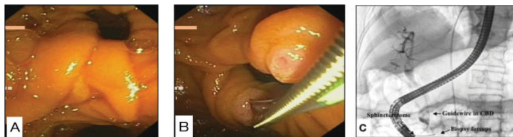
Fig. 1 (A) Side view endoscopy showing a large periampullary diverticulum. Papilla could not be identified. (B) Sphincterotome and biopsy forceps being used simultaneously to explore the papilla and facilitate cannulation. (C) Fluoroscopy image showing biliary cannulation by simultaneous use of biopsy forceps and sphincterotome.

A 52-year-old male, known case of type 2 diabetes mellitus, presented with jaundice and fever for the last 2 weeks. On