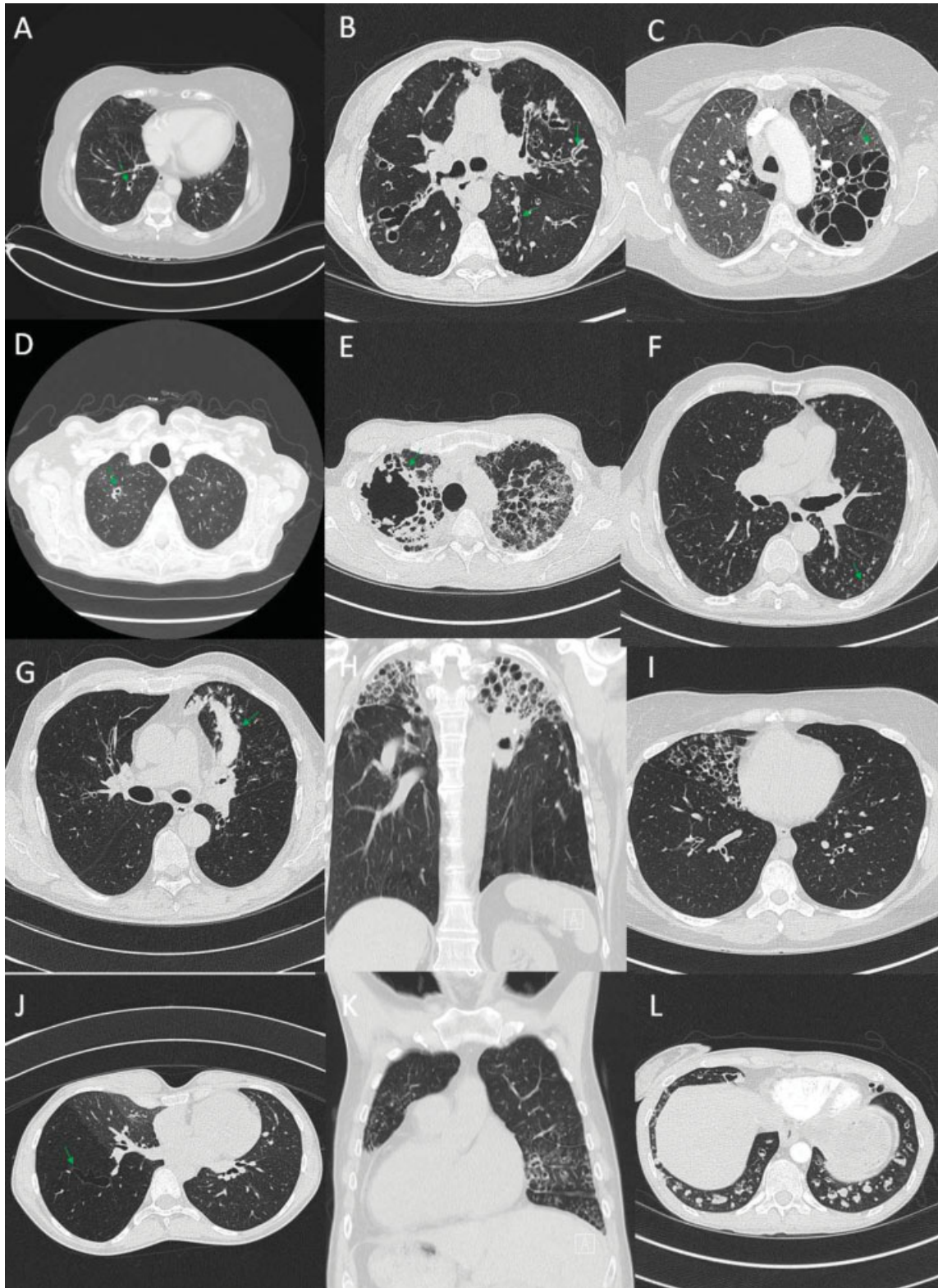
Fig. 2 Radiological phenotypes. (A) Cylindrical bronchiectasis with signet ring sign. (B) Varicose bronchiectasis. (C) Cystic bronchiectasis. (D) Cavity in the right upper lobe. (E) Chronic pulmonary aspergillosis with right upper lobe cavitation with intracavitary material. (F) Tree-in-bud appearance. (G) Bronchocoele in the left upper lobe in allergic bronchopulmonary aspergillosis. (H) Bilateral upper lobe bronchiectasis. (I) Isolated right middle lobe bronchiectasis. (J) Bronchiectasis in an area of hyperlucent lung with reduced vascularity (Swyer–James syndrome). (K) Situs inversus and bronchiectasis. (L) Mucus impaction of bronchiectatic airways.