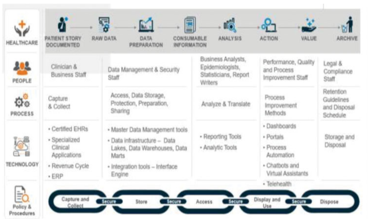
Fig. 3 Data and information lifecycle in the context of the patient story.

The data governance program also recognized the need for organizational policies to support and drive the discipline of governance. Establishing a reference framework provided a way